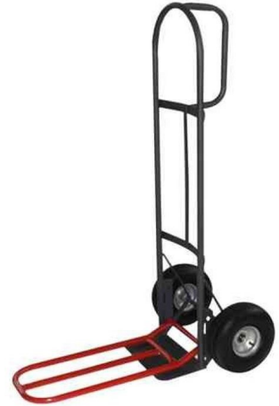
#GMO78 Monster Truck with Nose Plate Extension